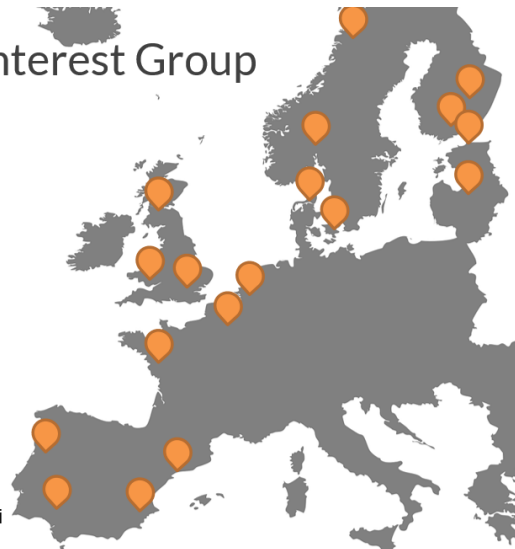
Figure 1: International working group of public procurers established as part of Circular PP

Latvia: Latvian Environmental Investment Fund